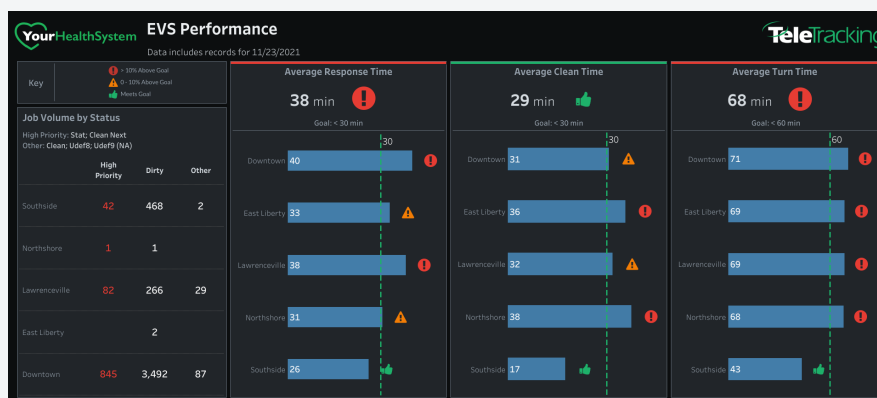
EVS Performance Screen

With SynapseIQ Enterprise Analytics, operational data is presented in an easy to consume format with the ability to drill-down for deeper analysis. Extensive customized configurations deliver unprecedented visibility to pinpoint inefficiencies such as room turnover times exceeding pre-determined thresholds and immediately identify the root causes.